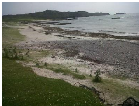
The Machair (raised beach), Iona