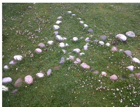
Trefoil at St Columba's Bay

Your image deep within us (Celtic traditional)