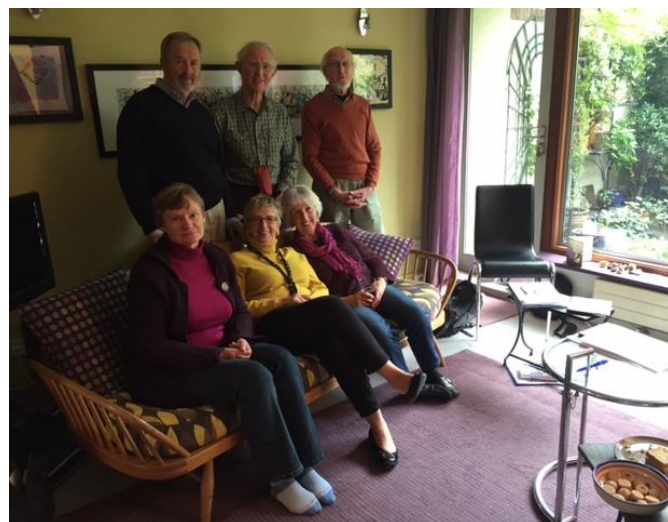
Review Group – October 2015