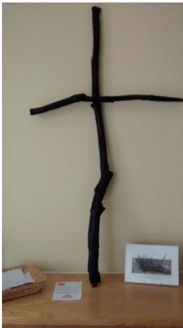
(The cross is now with CF North).