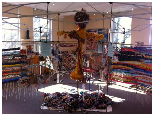
The Hopeweavers' community invited us to prayerfully add to their weaving.