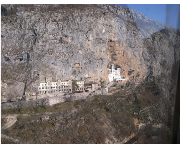
The Monastery of Ostrog, Montenegro, dedicated to St Basil who was buried here.