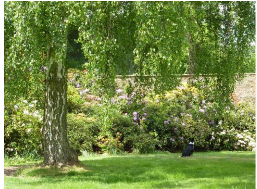
The first Quiet Garden at Stoke Poges

https://www.churchtimes.co.uk/articles/2017/13-april/features/features/the-greening-grace-of-a-garden