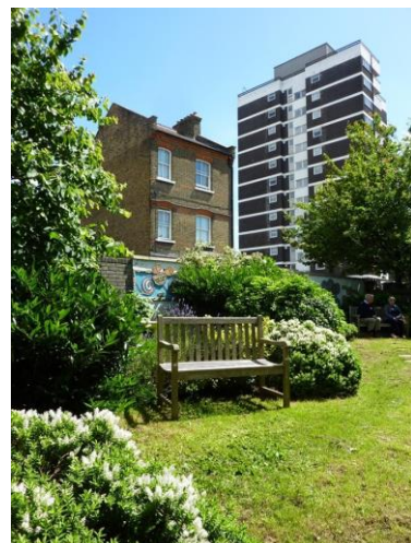
Quiet Garden, St Patrick's RC primary school, Kentish Town