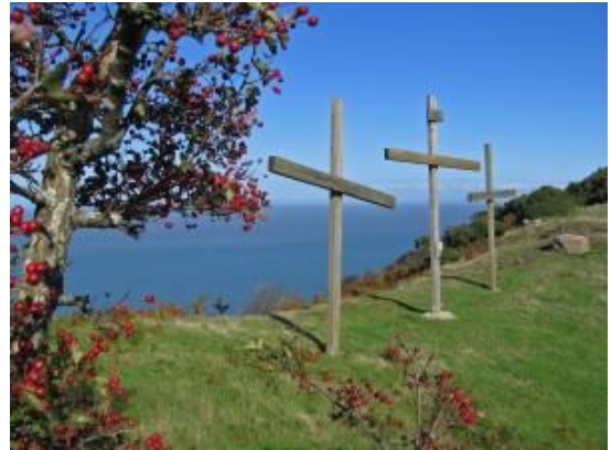
Above the Main House, Lee Abbey