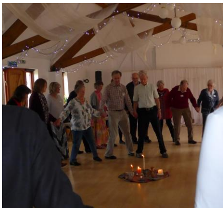
Behind the scenes at the day's end