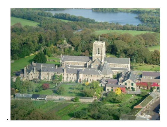
Mount St Bernard Abbey, Oaks Rd, Coalville, Leicestershire, LE67 5UL Friday March 9th - Sunday March 11<sup>th</sup>

Companions and Friends of Contemplative Fire will be exploring what it means to be In Community together. Set at Mount St Bernard Abbey near Loughborough in the Midlands, we hope it will offer reasonable access to all and give an opportunity to meet with those in the Midlands who have less opportunity to attend Contemplative Fire events.