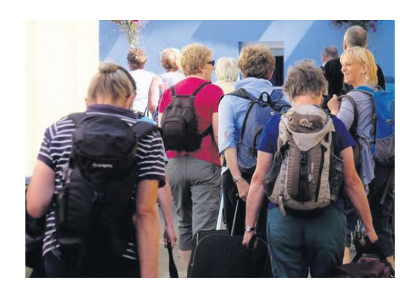
SMALL GROUP WALKING HOLIDAYS IN AN INFORMAL CHRISTIAN AMBIENCE TO PLACES AT THE EDGE...

Companions may be interested in the other holidays on offer too, with small groups.