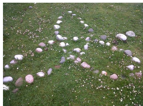
Trefoil at St Columba’s Bay

Your image deep within us (Celtic traditional)