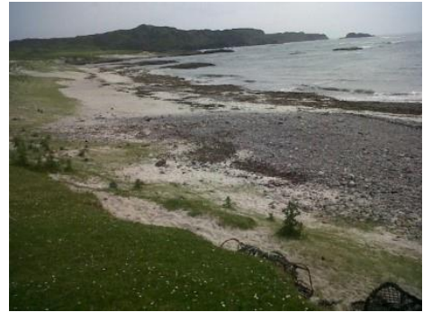
The Machair (raised beach), Iona