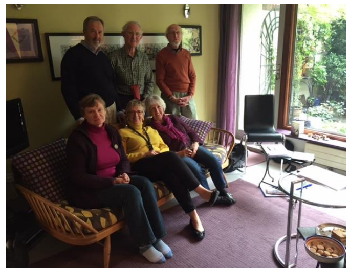
Review Group – October 2015